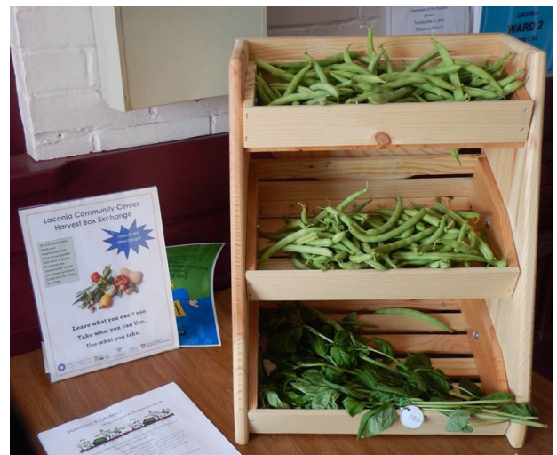
Harvest Box at Laconia Community Center.